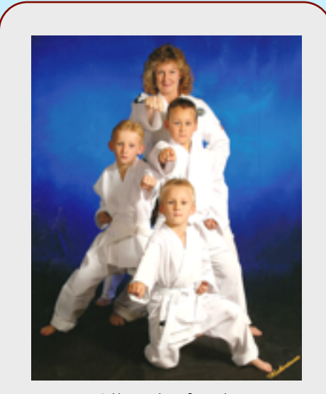
All in the family.

In characteristic self-effacing fashion, her remarks upon receiving the award were modest and to the