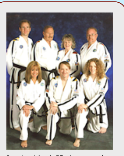
Leadership: it IS about service.

around the world (New Zealand, Australia, New Guinea, many others) and demonstrated in many more countries. She is the "Iron Lady" at Headquarters, answering questions, putting out fires, and keeping our potential chaos somehow looking smooth. She has given Taekwon-Do her time, skill, grit, intelligence, and love.